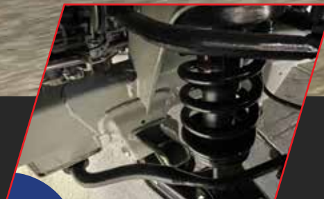
INDEPENDENT COIL SPRING SUSPENSION