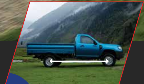
3 300 mm LONG WHEELBASE