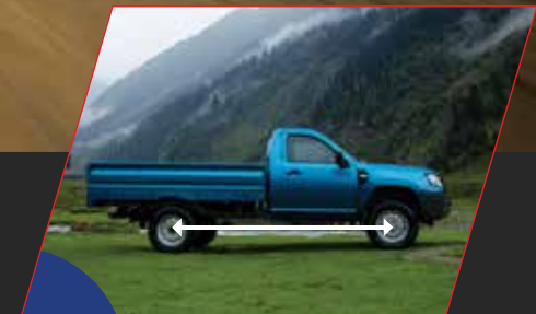
3 300 mm LONG WHEELBASE