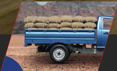
2 TON PAYLOAD