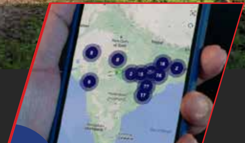
FLEET EDGE ENABLED