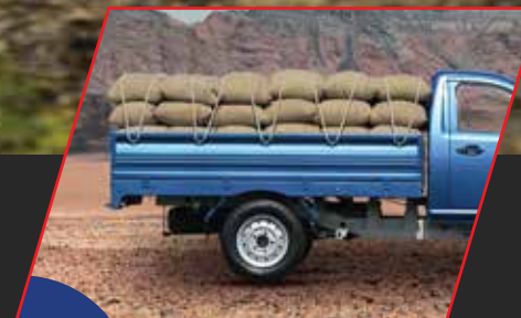
2 317 mm (7.6 ft.) x 1 793 mm (5.9 ft.) BIG LOADING AREA