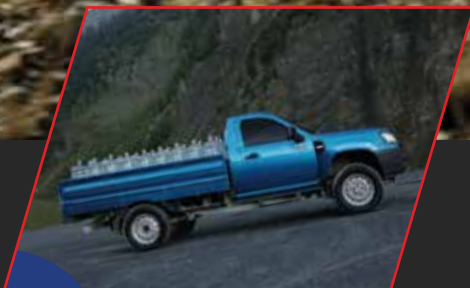
62 % GRADEABILITY