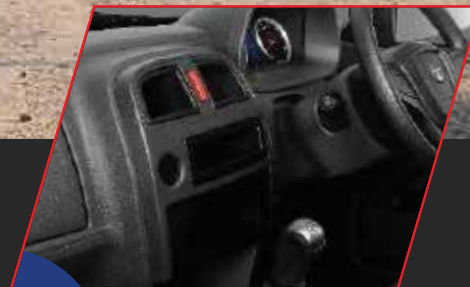
HEATING, VENTILATION, AND AIR CONDITIONING OPTIONAL