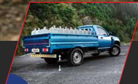
GROUND CLEARANCE - 210 MM