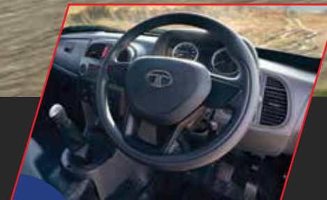
TILT ADJUSTABLE STEERING