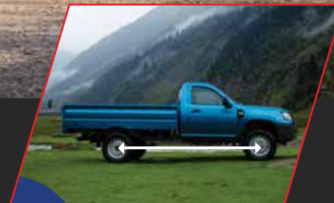
3 300 mm LONG WHEELBASE