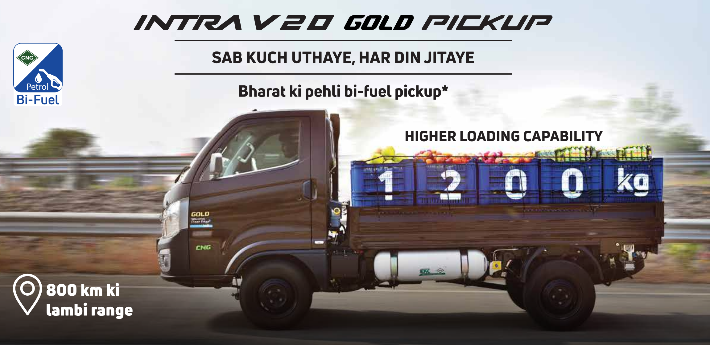
BIGGER LOADING AREA