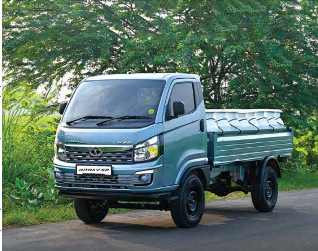
The images are only for representations and actual images of the product may vary.